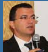
Mohamed Wadie Zerhouni