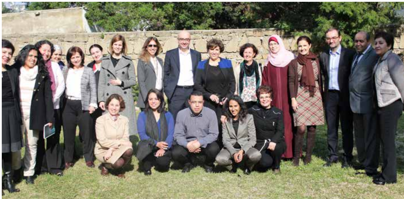
Pharmacovigilance workgroup, 2015