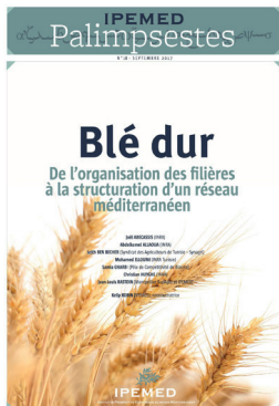
Durum wheat: from the organisation of industries to the structuring of a Mediterranean network, September 2017