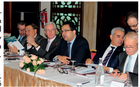
Gammarth seminar, Tunisia - January 2016

Developing a new “win-win” economic cooperation model based on shared benefit and technology transfer between Northern and Southern countries.