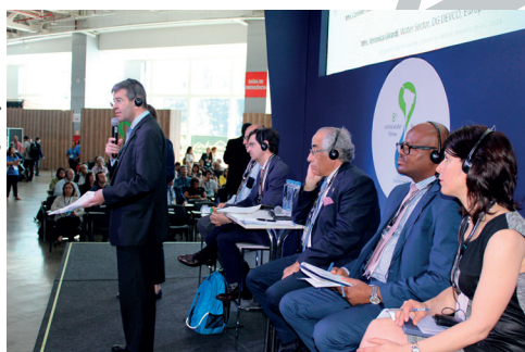
World Water Forum, Brazil - March 2018

Promoting an integrated management of water demand and resources, as well as a more inclusive governance, through the implementation of a “Mediterranean Water Agency”.